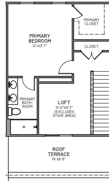
03 | THIRD FLOOR PLAN